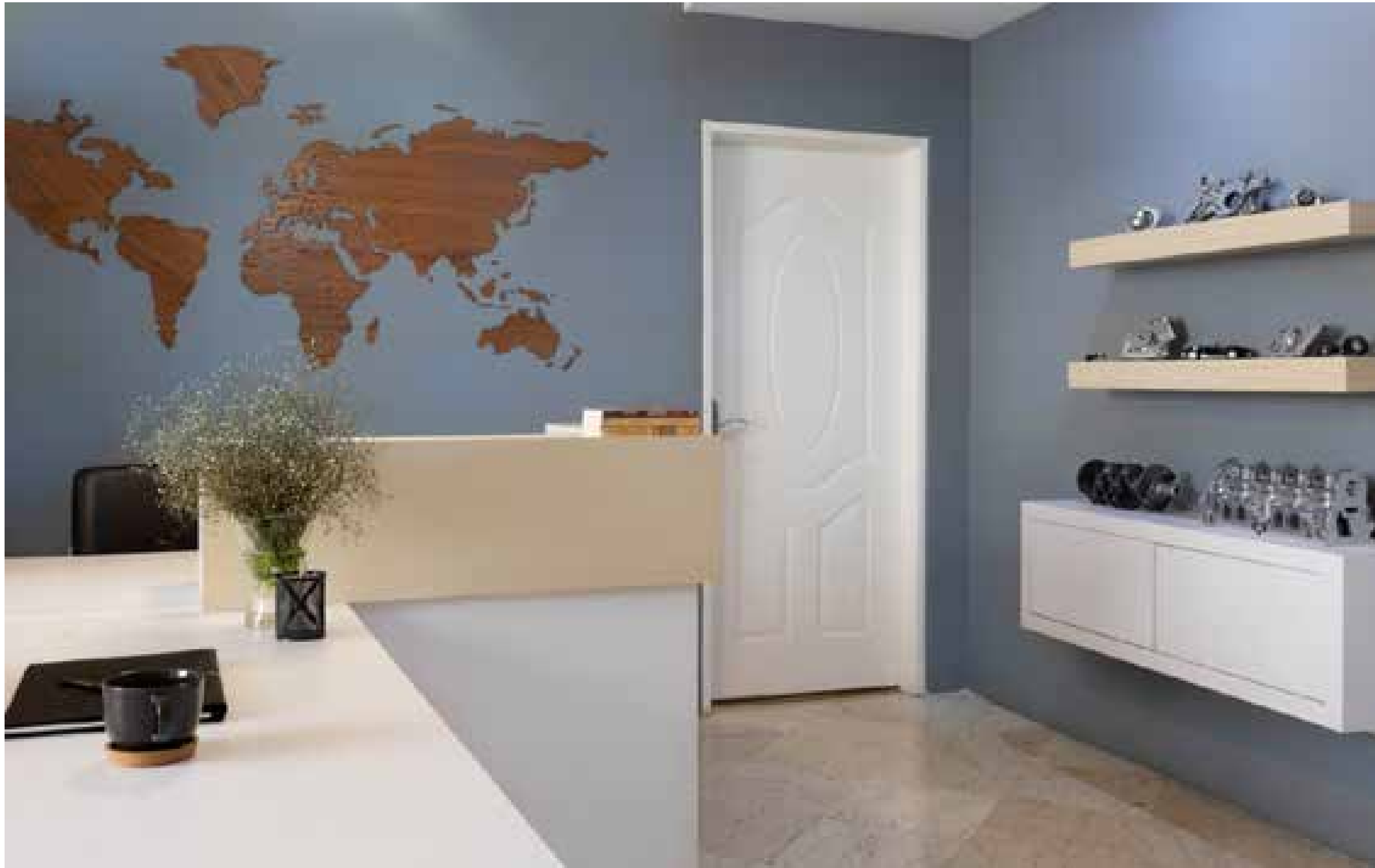
Architectural Photography | *Fatemeh Bank