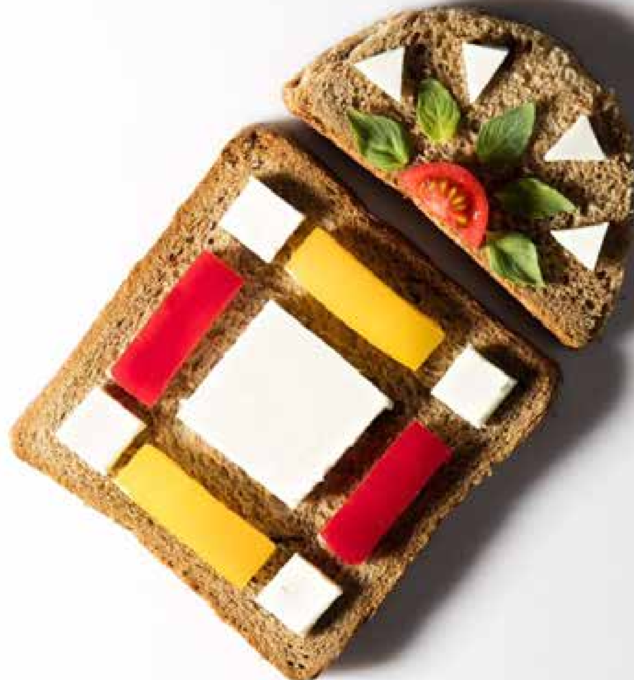
SABAH CHEESE Project | *Fatemeh Bank