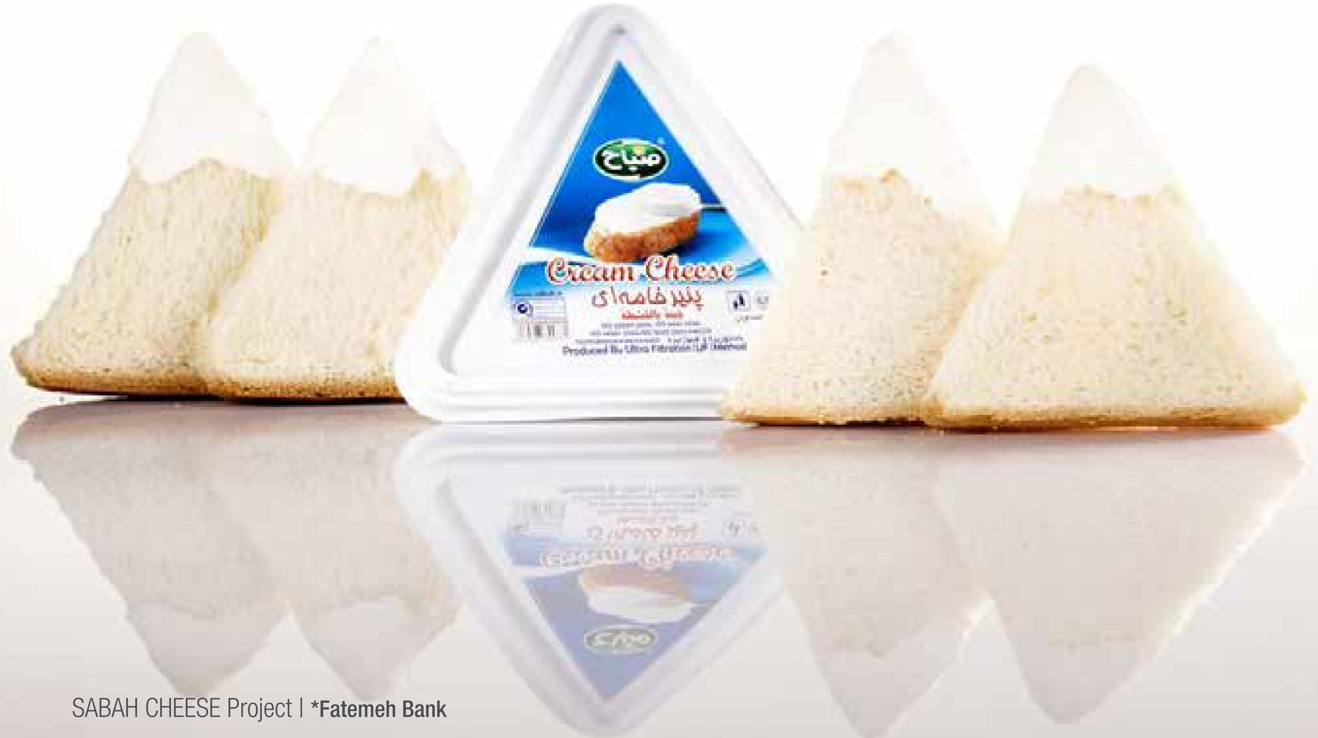
SABAH CHEESE Project | *Fatemeh Bank