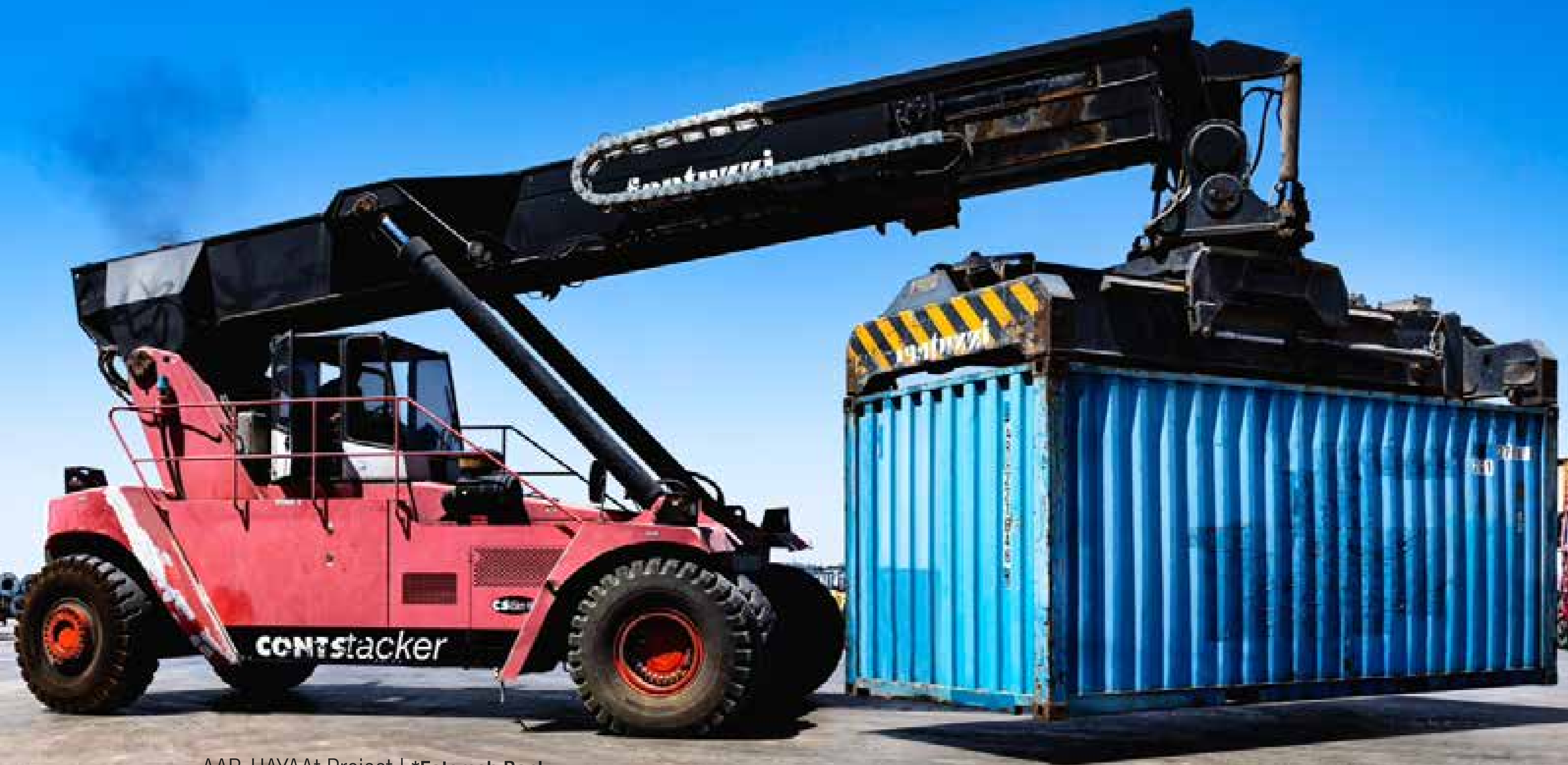
AAB-HAYAAt Project | *Fatemeh Bank