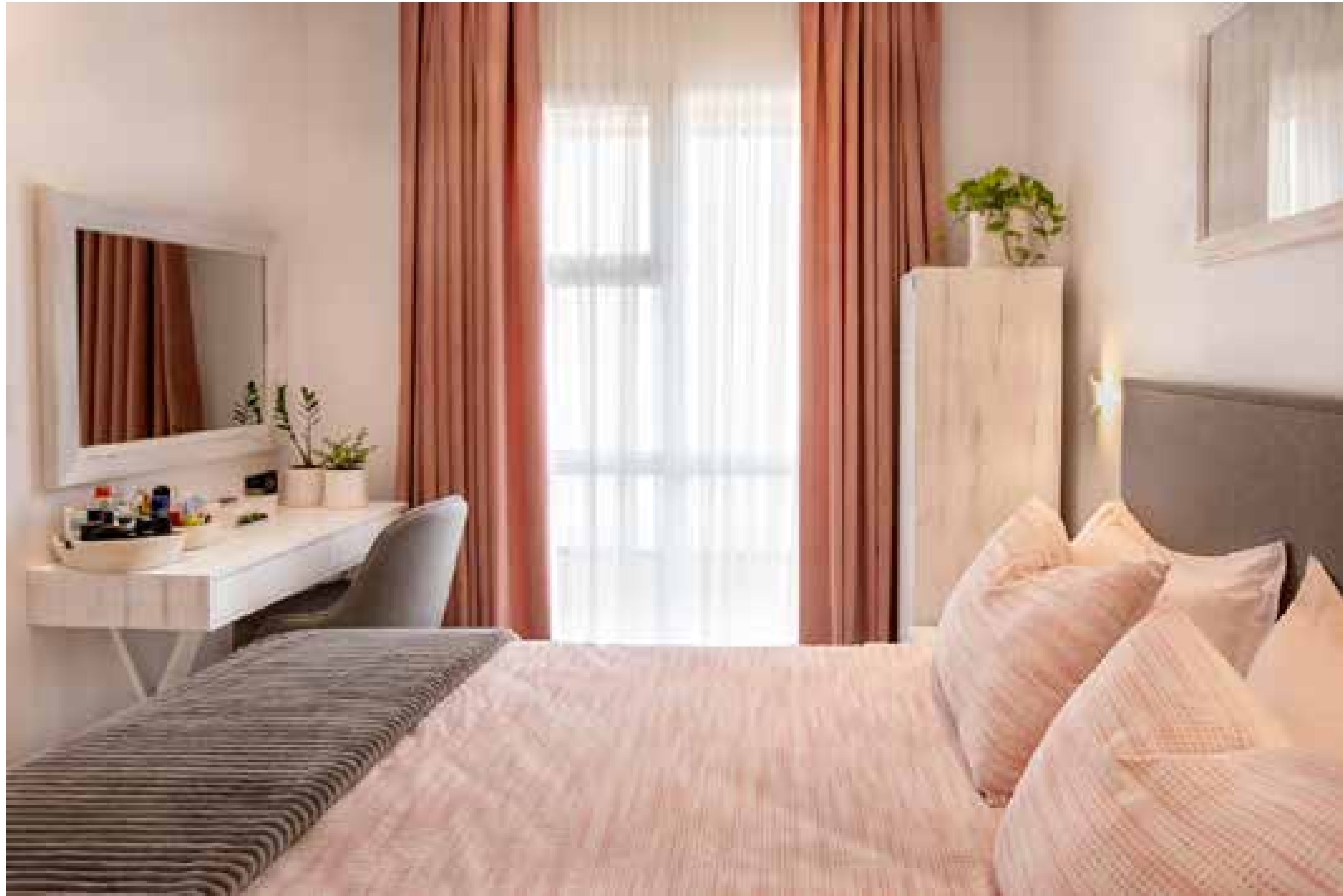
Architectural Photography | *Fateme Bank