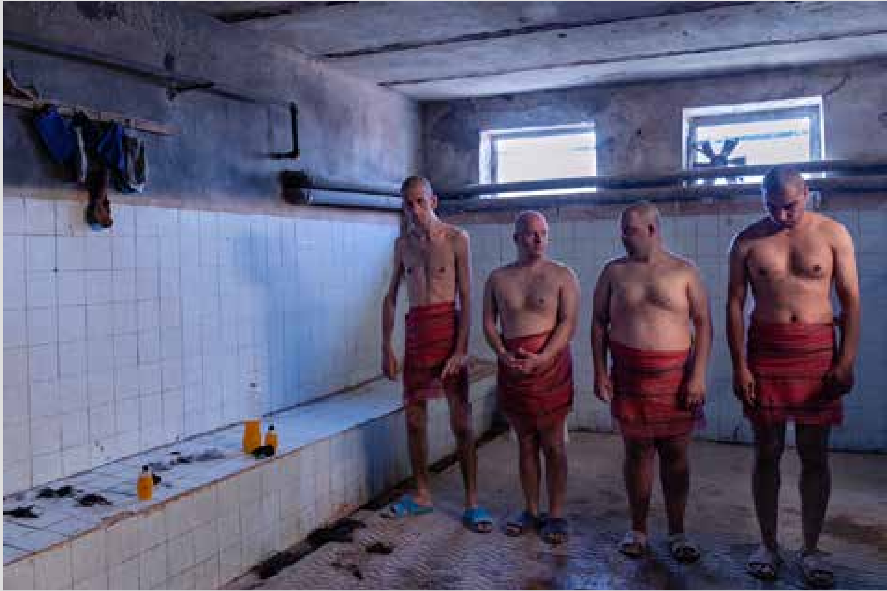
FILM Photography | *Fateme Bank