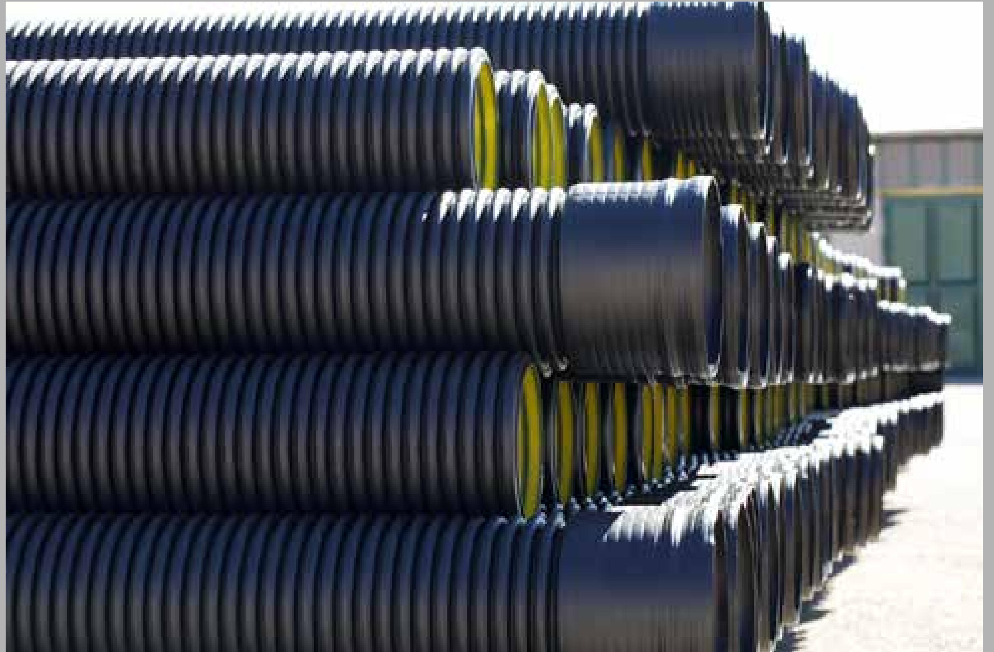
AAB-HAYAAt Project | *Fatemeh Bank