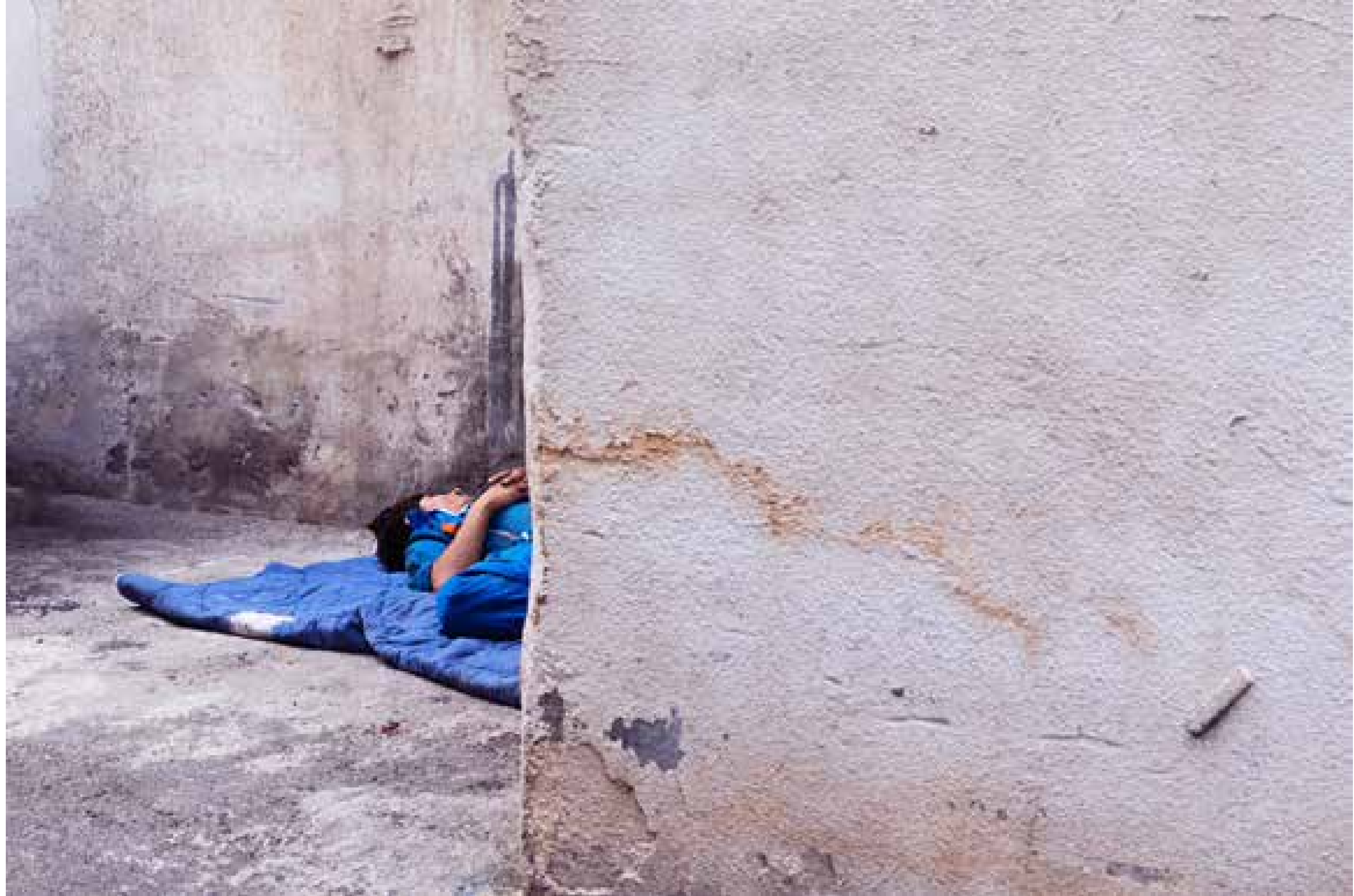
TEHRAN, the hidden pain | *Fateme Bank