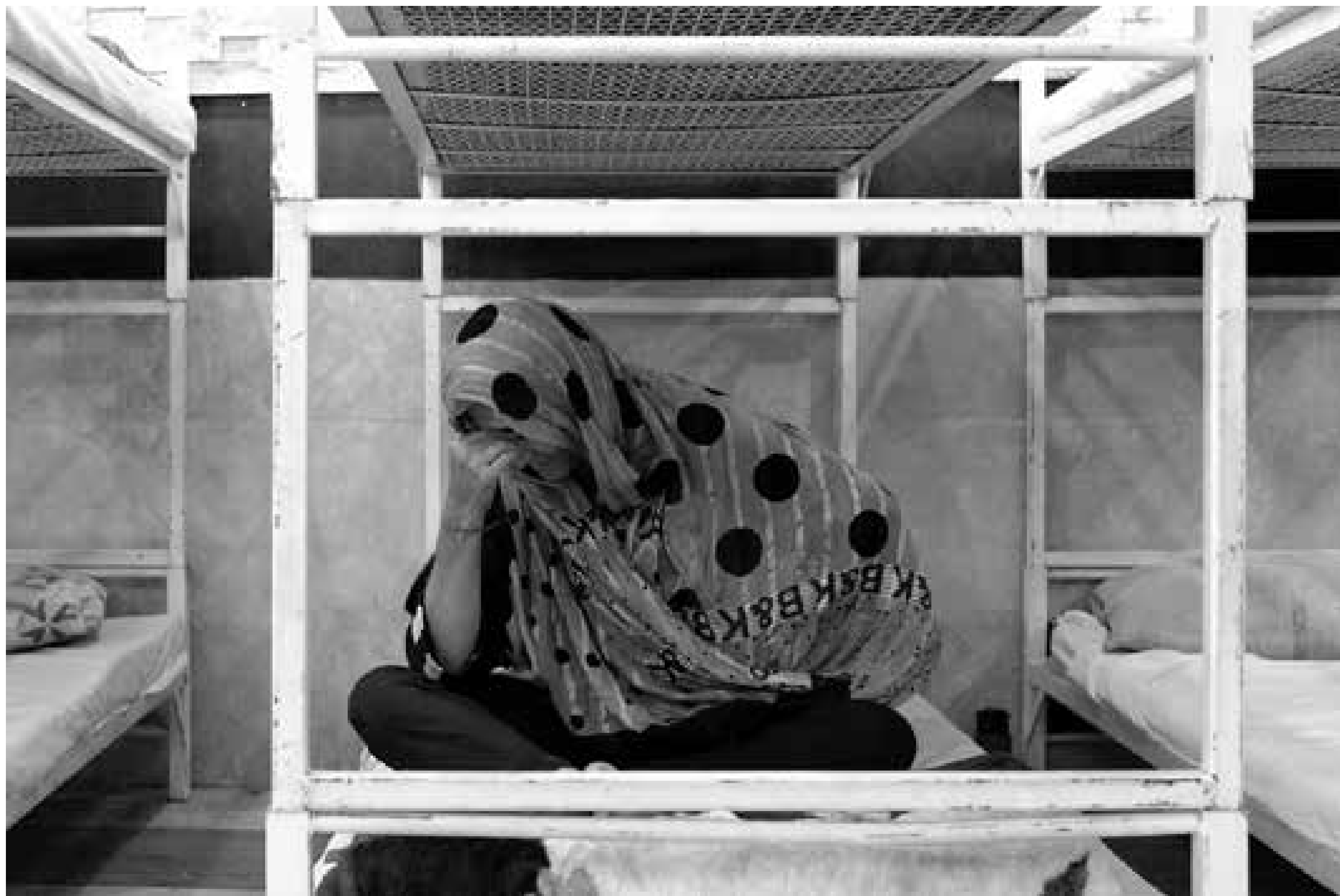
TEHRAN, the hidden pain | *Fateme Bank