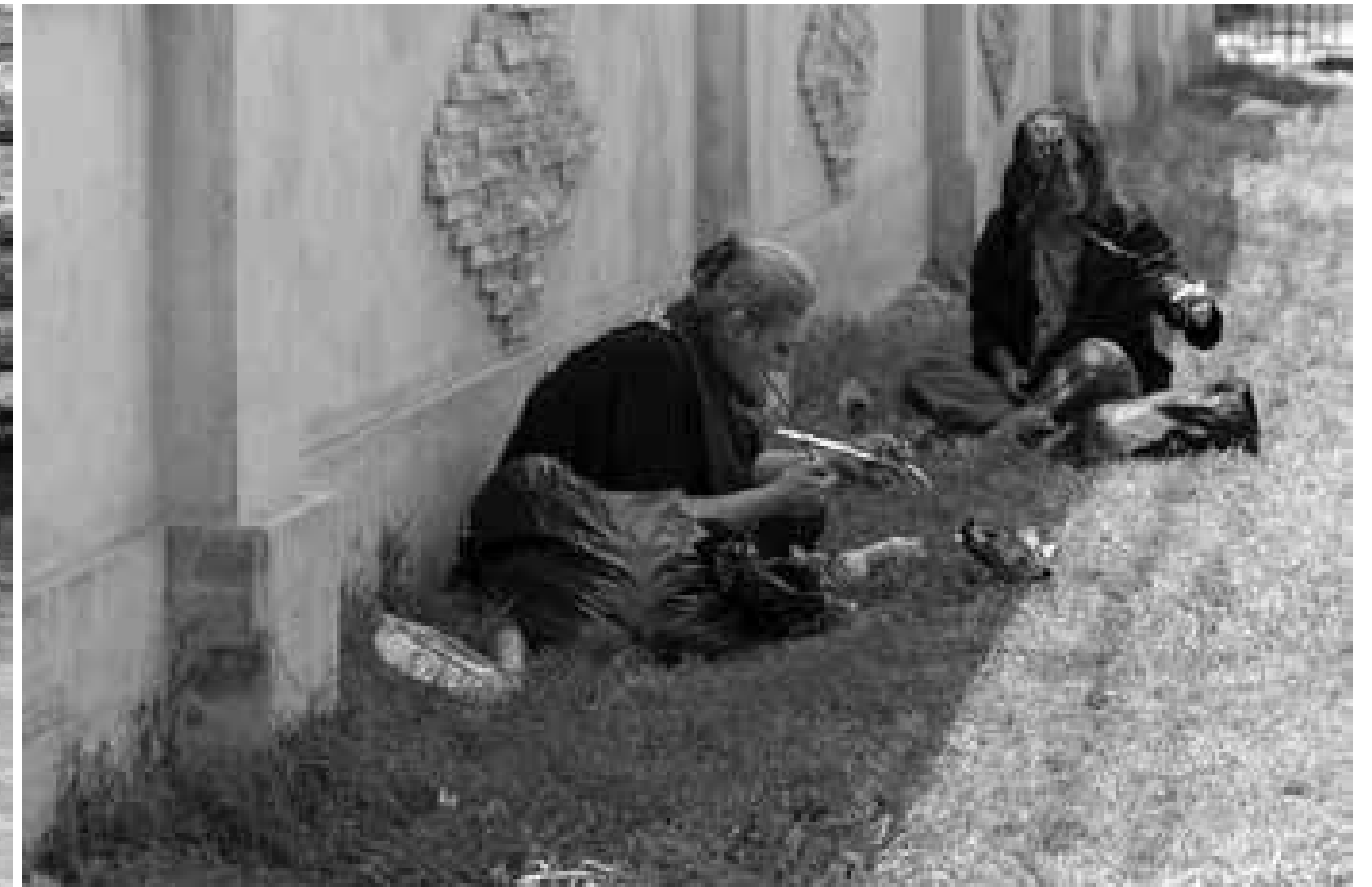
TEHRAN, the hidden pain | *Fatemeh Bank