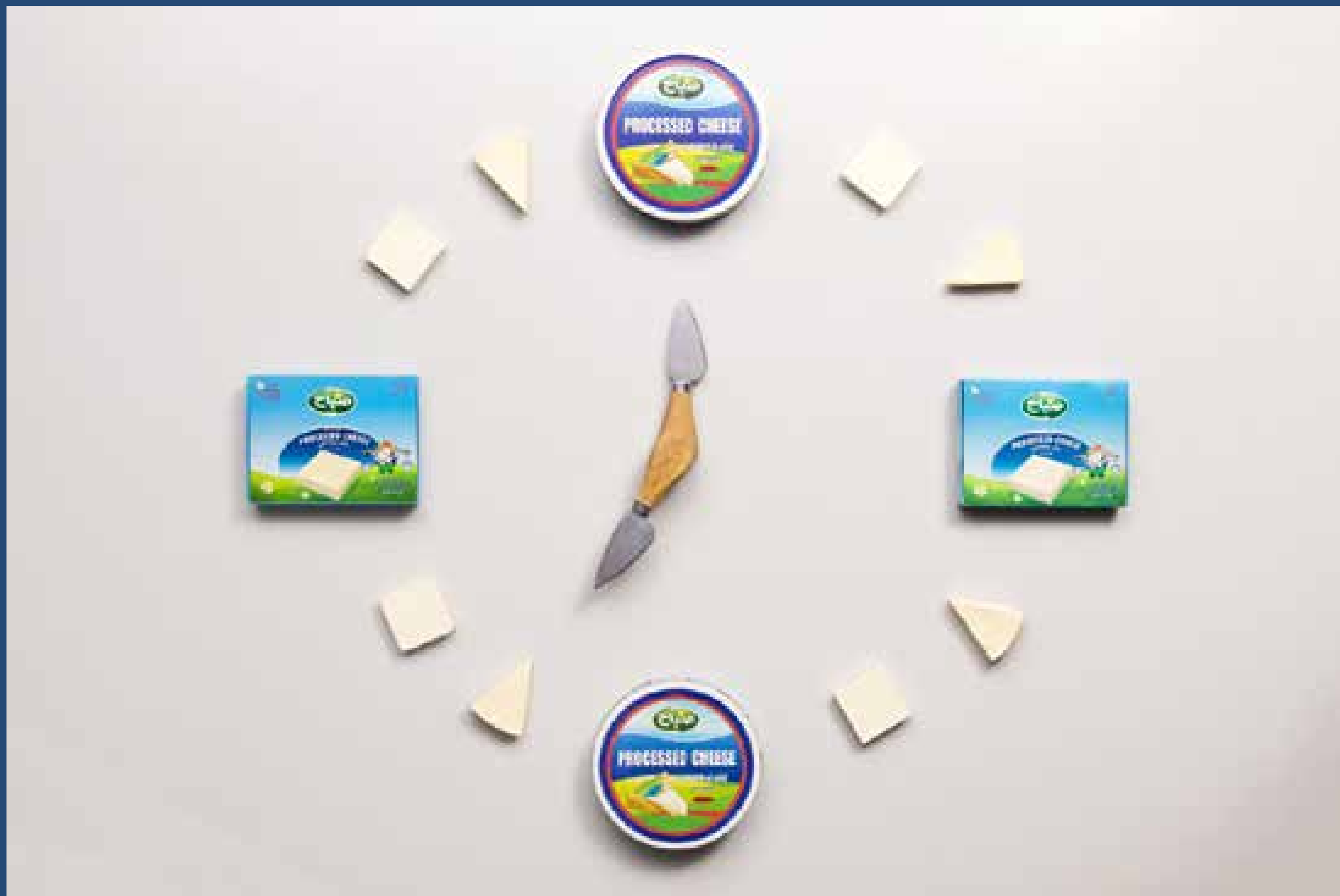
SABAH CHEESE Project | *Fatemeh Bank