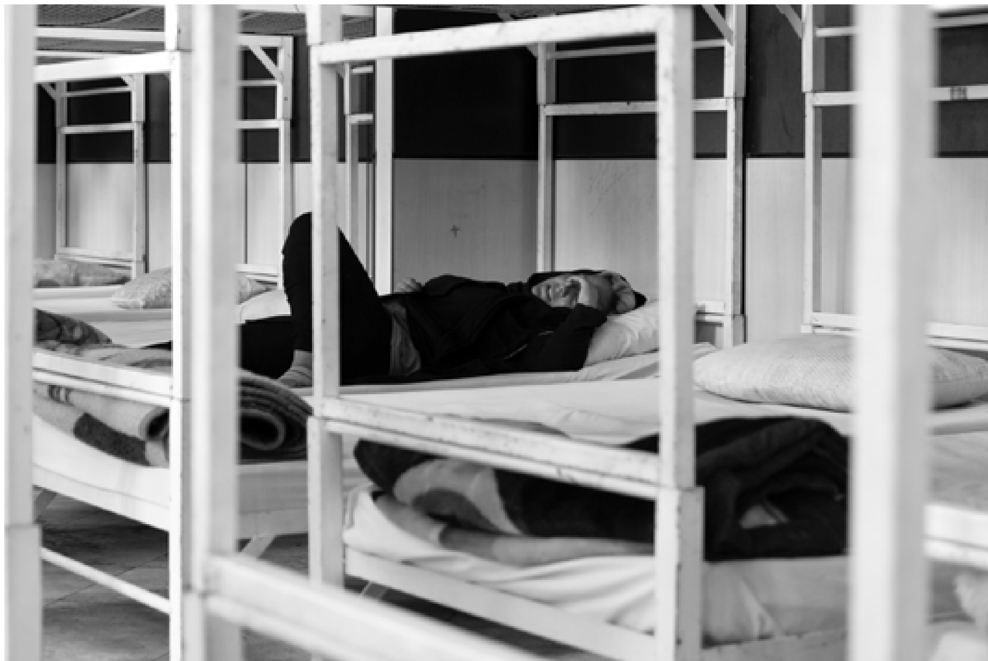
TEHRAN, the hidden pain | *Fateme Bank