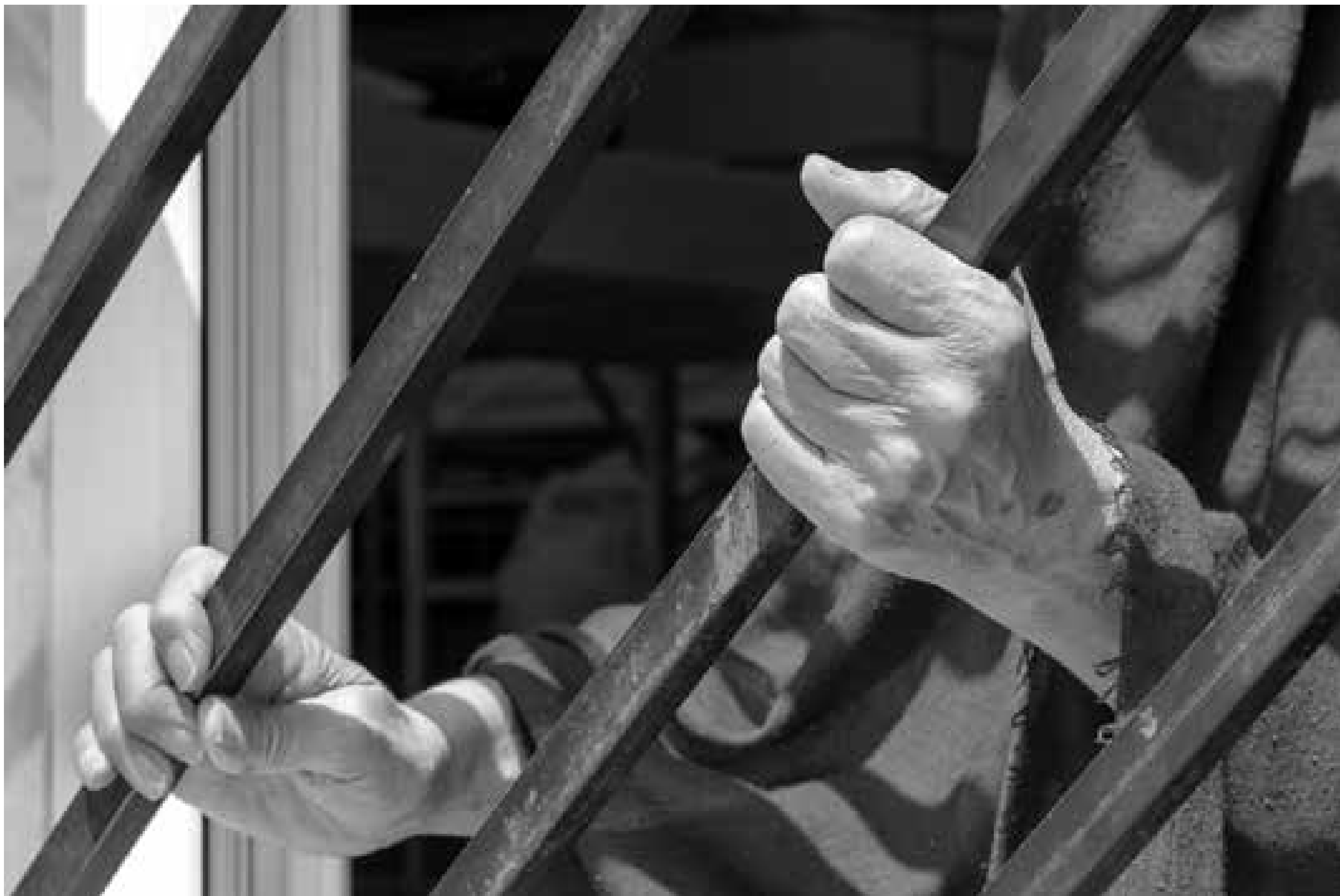
TEHRAN, the hidden pain | *Fateme Bank