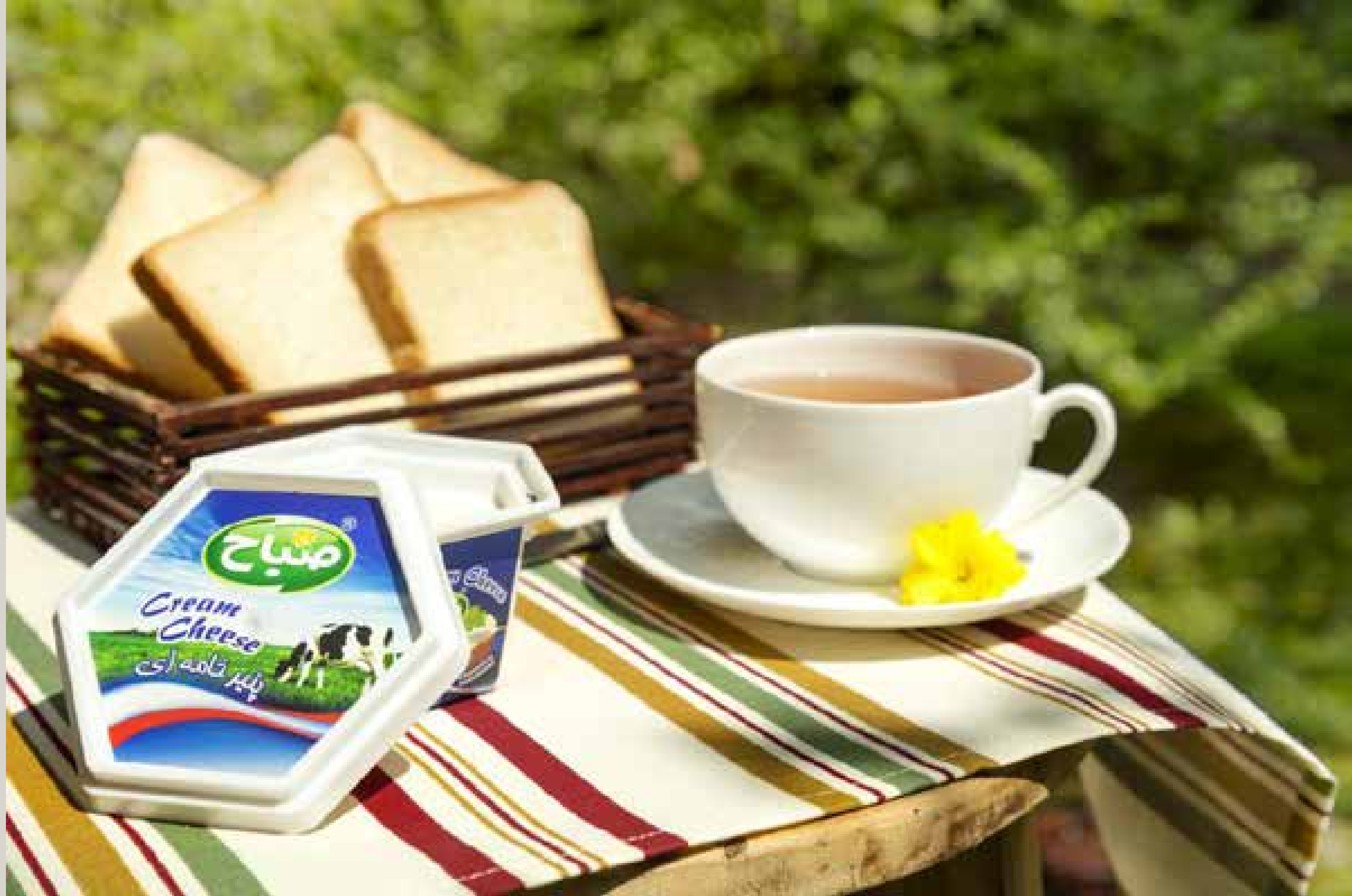
SABAH CHEESE Project | *Fatemeh Bank